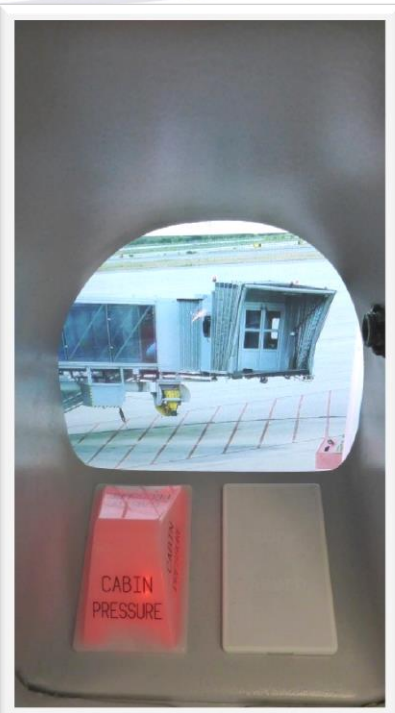
Door Visual System