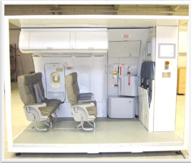
Inside View 1L/OWE