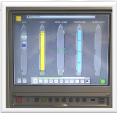
Flight Attendant Panel