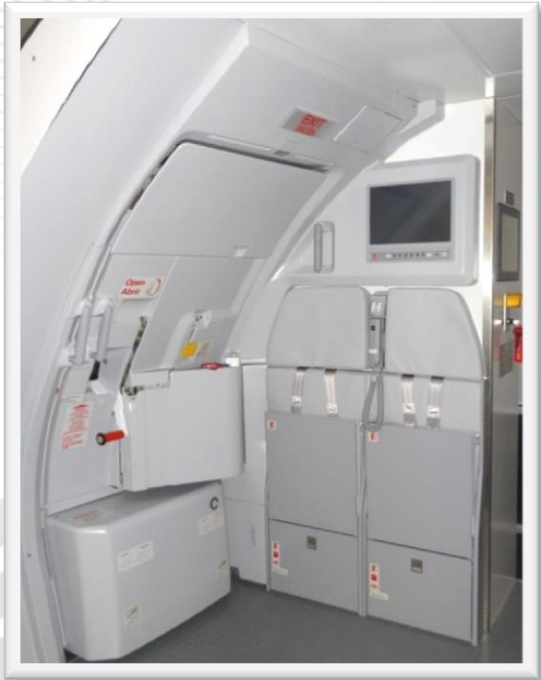
Inside View 1L Door