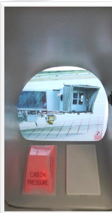
Door Visual System