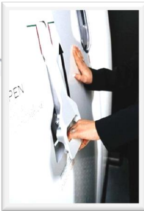
Outer Door Handle