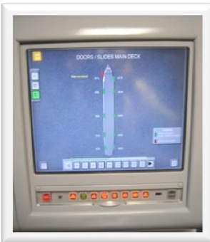
Forward Attendant Panel